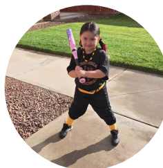
Sophie Soccer Star